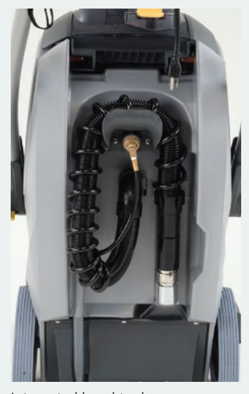
Integrated hand tool (standard on XP and XLP models)

Visit http://www.advance-us.com or contact your Advance sales representative to learn more.